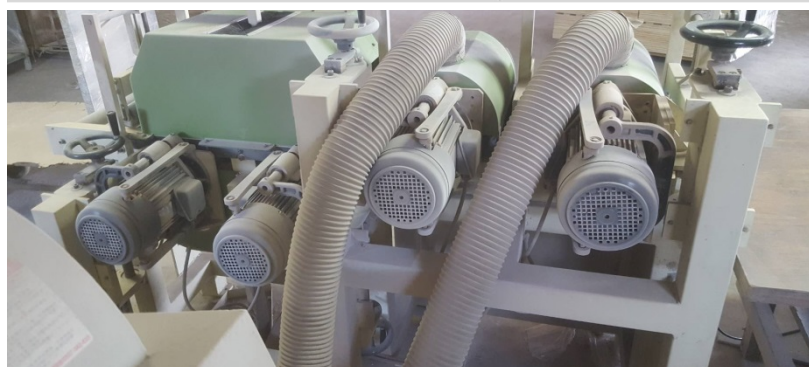
The Sanding heads adjust separately Upward, Downward