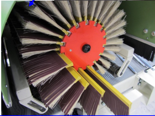
Sanding strip+wooden brush strip 砂布絲+木棕刷條

It's very easy and convenient to replace the brush wear strip on the hubs