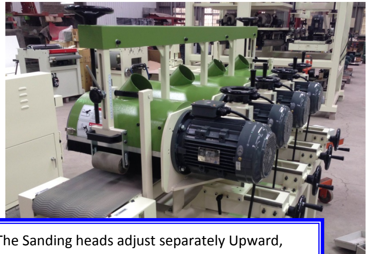
The Sanding heads adjust separately Upward, Downward, forward ,Backward