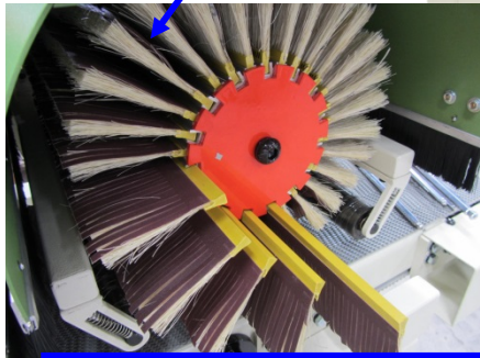
Sanding strip+wooden brush strip 砂布絲+木棕刷條