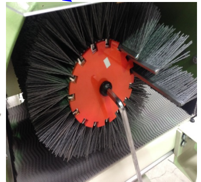
Abrasive Nylon Brush Strip 尼龍砂鋼刷條

It's very easy and convenient to replace the brush wear strip on the hubs